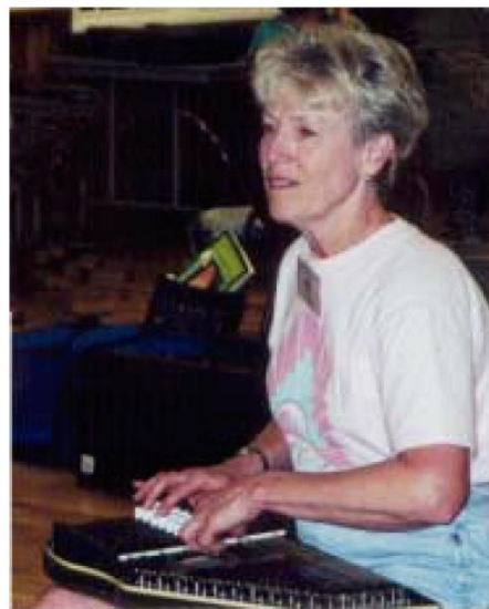
Figure 2 From the Georgia Autoharp Workshop and a web photo of Dolly